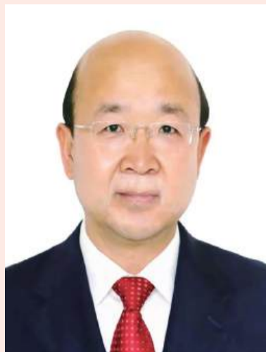
Undated file photo of Commissioner Liu Xianfa.

Looking back over the past 25 years, with the strong support of the Central People's Government and the mainland, Macao's "one center, one platform, and one base" development has been deepened, and cooperation with countries and regions that jointly build the "Belt and Road" with high quality has continued to deepen. The number of international "sister cities" and "circles of friends" is growing more and more, and there are more and more "Macao Golden Business Cards" such as "City of Gastronomy", "City of Culture" and "City of Events". The advantages of the base for cultural exchanges and cooperation between China and foreign countries have become more prominent, and Macao's international influence and prestige have been greatly improved. It has developed into a world-renowned international metropolis that connects the inside and the outside world, and has become an important bridgehead for the country's high-level opening-up to the outside world. It has made important