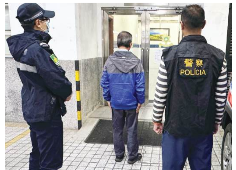
This undated handout photo provided by the Public Security Police (PSP) yesterday shows the local theft-by-finding suspect being escorted by PSP officers to a police station in Taipa.

The Public Security Police identified the suspect in the case, Ng, and intercepted him in the afternoon of the following day