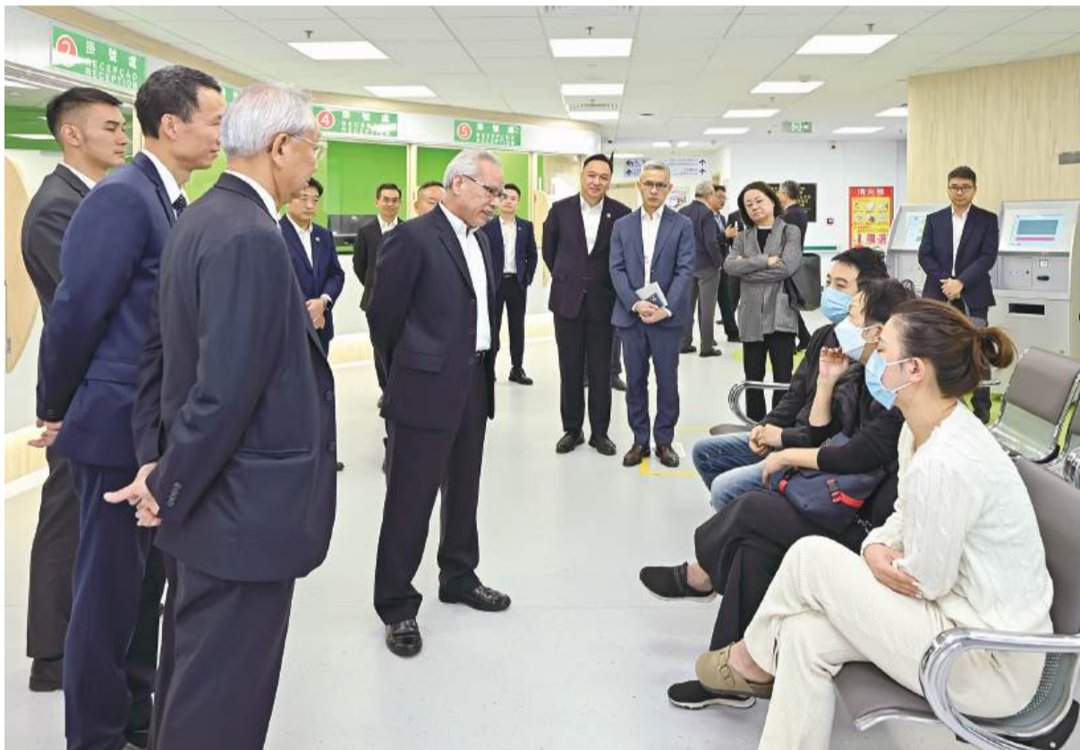
This photo released by the Macau Government Information Bureau (GCS) last night shows Chief Executive Sam Hou Fai (centre) talking to Macau residents seeking treatment at the Macau New Neighbourhood (MNN) residential estate's health station in Hengqin yesterday.

According to the statement, Sam also visited the Traditional Chinese Medicine Science and Technology Industrial Park of Cooperation between Guangdong and Macau, where he went to the