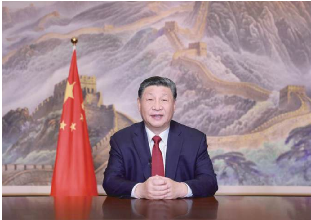
President Xi Jinping delivers his 2025 New Year's Address through China Media Group on New Year's Eve in Beijing.

This year, I have visited many places across the country and seen how our people enjoy their enriching lives. I saw the big, red Huanian apples in Tianshui, Gansu and the fishing boats in Aojiao Village, Fujian loaded with their catches. I watched the millennium-old "Eastern Smile" in the Maiji Mountain Grottoes, and I learned more about good-neighborliness passed from generation to generation in Liuchixiang Alley. I enjoyed the hustle and bustle in Tianjin's Ancient Culture