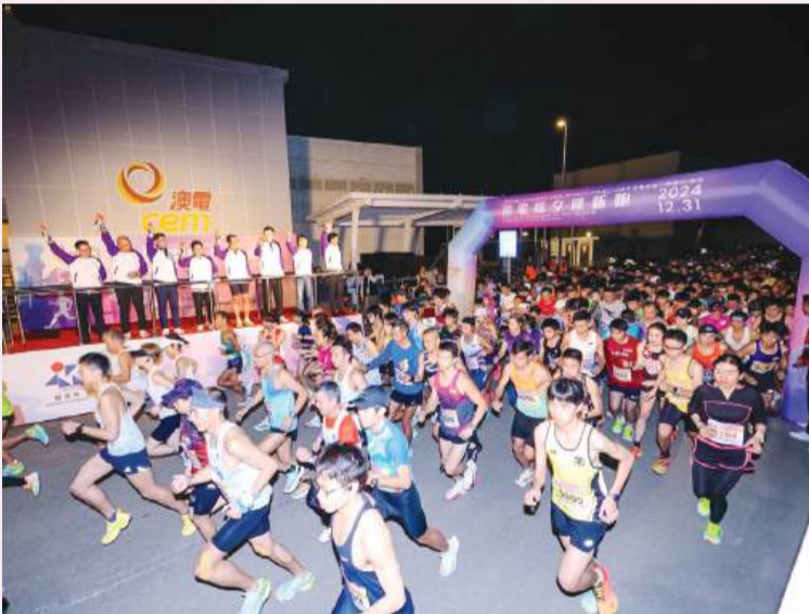
This photo downloaded from the CEM website shows officials starting the "2024 Fourth Round of the Macau Long-Distance Running League: CEM New Year's Eve Run" on Tuesday night as runners set off.