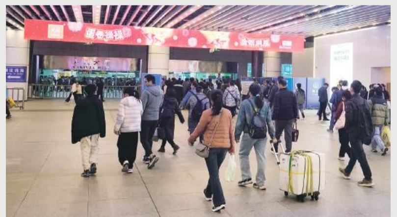
This photo taken last week shows border crossers on their way to Zhuhai's Gongbei checkpoint after completing departure formalities at Macau's Barrier Gate checkpoint.

Macau's most popular English-language newspaper – Your trustworthy source of news & views