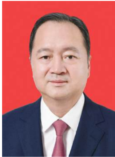
Undated file photo of Macao-based Liaison Office Director Zheng Xincong.

"One Country, Two Systems" with Macao characteristics has achieved universally recognized success.